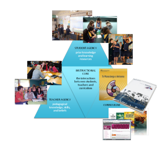
Figure 1. The instructional core

The most important feature of our education system is the quality of the moment-by-moment and day-by-day interactions that teachers have with students around curriculum (see Figure 1: The instructional core). The quality of these interactions is driven by the moment-by-moment, day-by-day decisions that teachers make (along with students, other teachers and school leaders, and parents/family/whānau, hapū, iwi and community) about what has been the result of teaching, what is important to learn next, and what will support students to learn.